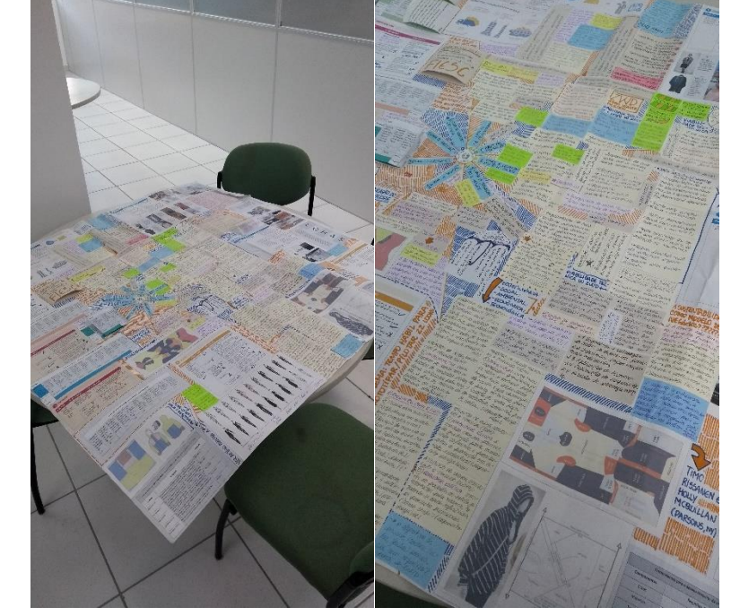
Figure 2. Photographic records of the construction of the ZWTAD, based on GPD

In the seventh step, Merino (2014; 2016) anticipates that the prototype that best meets the project's specifications will be chosen. At this point, the product must be tested alongside potential buyers through tools that evaluate ergonomics, apparent quality, usability, comfort, or other requirements deemed pertinent to the product. At last, in the eighth step, the systemic thinking must be favored, and the environmental, economic, and social impacts of the product must be taken into account. Figure 2 presents the application of the GDP's visual panel in the ZWTAD context.